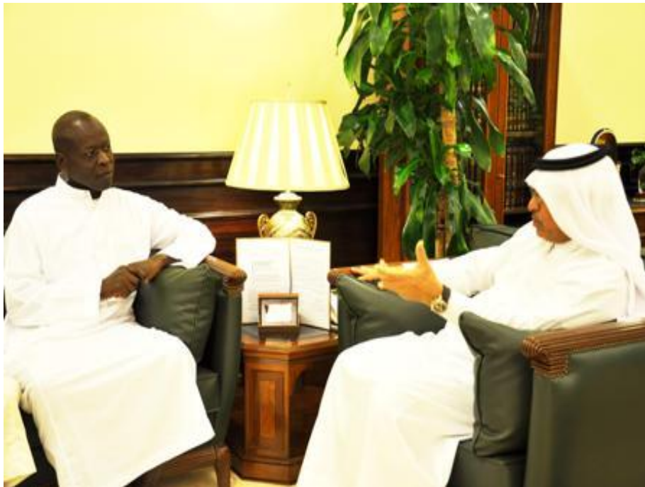
(On left - Sayid Obama)